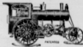
AN AVERY UNDERMOUNTED ENGINE