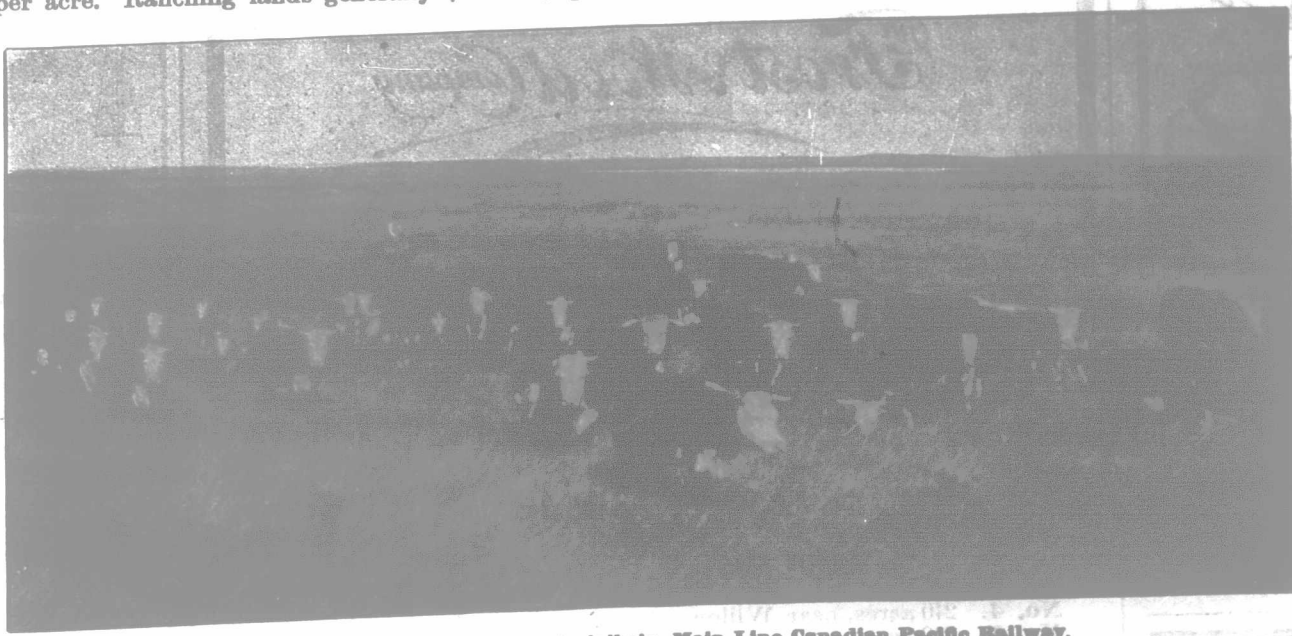
Hereford Cattle, Crane Lake, Assiniboia, Main Line Canadian Pacific Railway.

The Canadian Pacific Railway Company have 12,000,000 acres of choice farming lands for sale in Western Canada. Manitoba and Eastern Assiniboia lands generally from $4 to $10 per acre, according to quality and location. South-western Assiniboia and Southern Alberta lands, $3.50 to $8 per acre. Ranching lands generally $3.50 to $4 per acre. Northern Alberta and Saskatchewan lands generally $6 to $8 per acre.