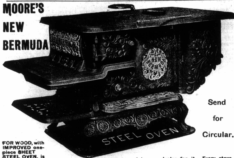
FOR WOOD, with IMPROVED one-piece SHEET STEEL OVEN, is heavy, durable, economical, and a perfect baker. Ask your dealer for it. Every stove guaranteed.

The D. Moore Co., Limited, Hamilton, Canada.