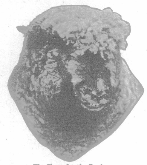
The Sheep for the Producer, Butcher and Consumer. Our Oxfords Hold an Unbeaten Record for America.

We have at present a choice offering of yearling ewes and rams, as well as a lot of good ram and ewe lambs—the choicest selection of flock-headers and breeding stock we have ever offered.