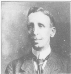
Pierre B. Mignault, Law, 1878

A member of the Bar who has gained his high position by the most eminent talents, both as a practising barrister and as a legal writer, the Honourable Pierre B. Mignault, Justice of the Supreme Court of Canada, is recognized to be amongst the leading jurists of the Dominion and is one of the highest authorities at the Canadian Bar. From the year of his graduation, until the time of his appointment to the Supreme Court, Justice Mignault practised as an advocate in Montreal. He became a member