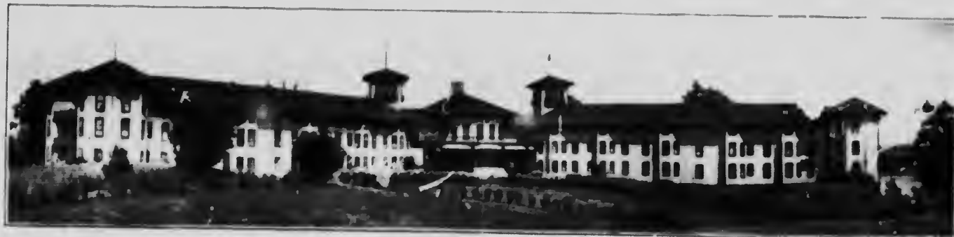
The Royal Muskoka on Lake Rosseau, is one of the finest Summer " " in Canada

passengers, and, by diverging routes, are so run that all parts of the lakes can be reached twice daily in either direction. Many days can be spent in delightful steamer excursions around the lakes and through the rivers, including visits to Shadow P and the Falls of Bala.