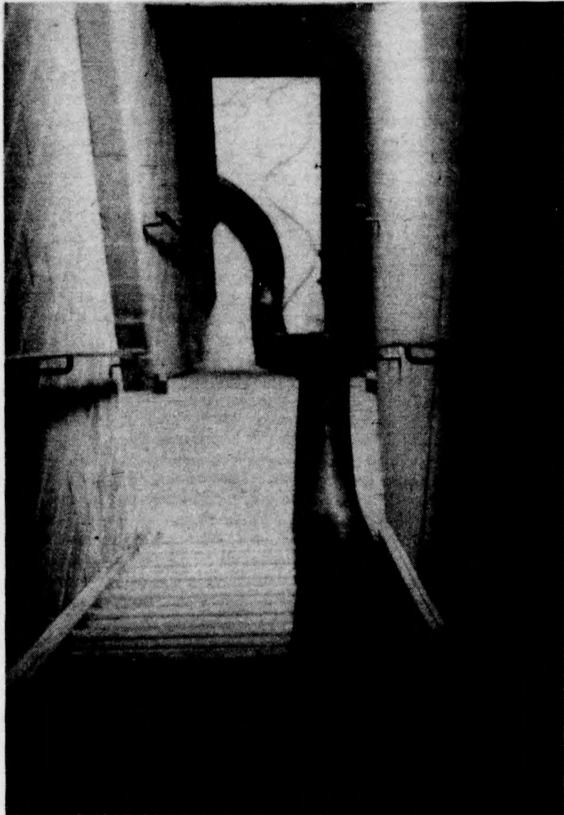
Air ducts were cleaned after staff took a breather.

"Samples of the dust in [a duct] were taken and the results were [favourably] well below the allowable Time Weighted Average and the Threshold Limit