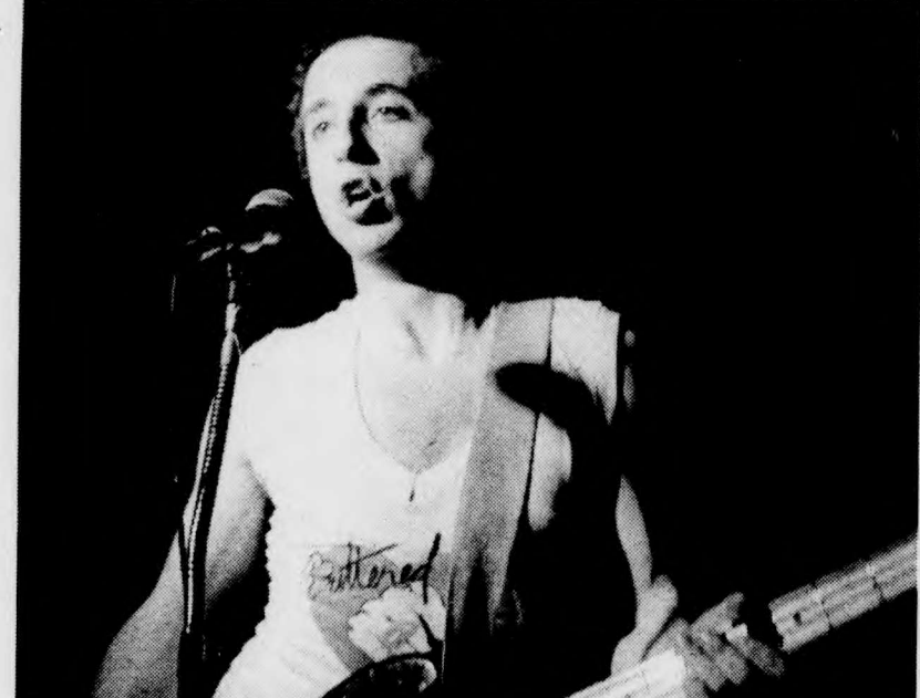
....deafening applause and roaring acceptance.

Although the quality of the performance I attended was slightly inconsistent, it was a very enjoyable experience. Romeo and Juliet is a student performance worth attending. There will be performances March 8,9, and 10 at Glendon College