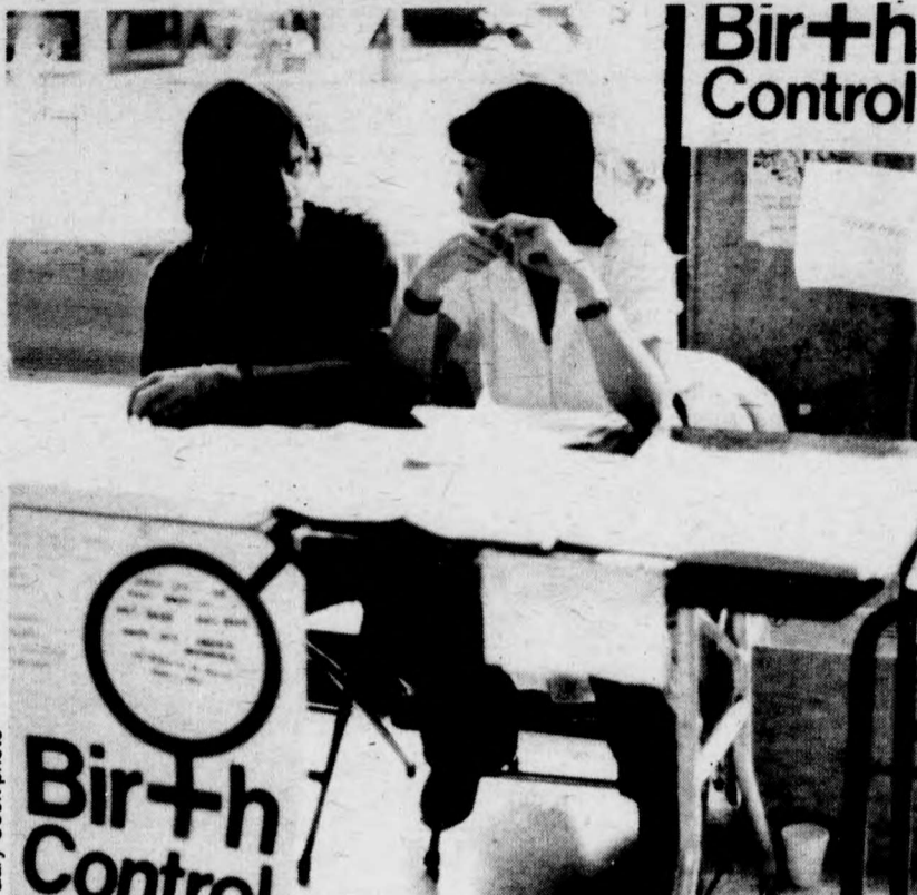
One of the over 30 clubs participating in last week's clubs day.

This year a number of clubs have started up and have been given assurances of funding from the CYSF.