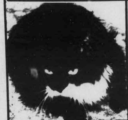
Hitler Kitty "Revenge - they cut my column."