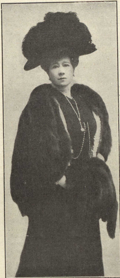
Miss Marie Tempest, who is playing in "Penelope," direct from London

Miss Tempest will be supported here by the same company of English actors that appeared with her in London so long.