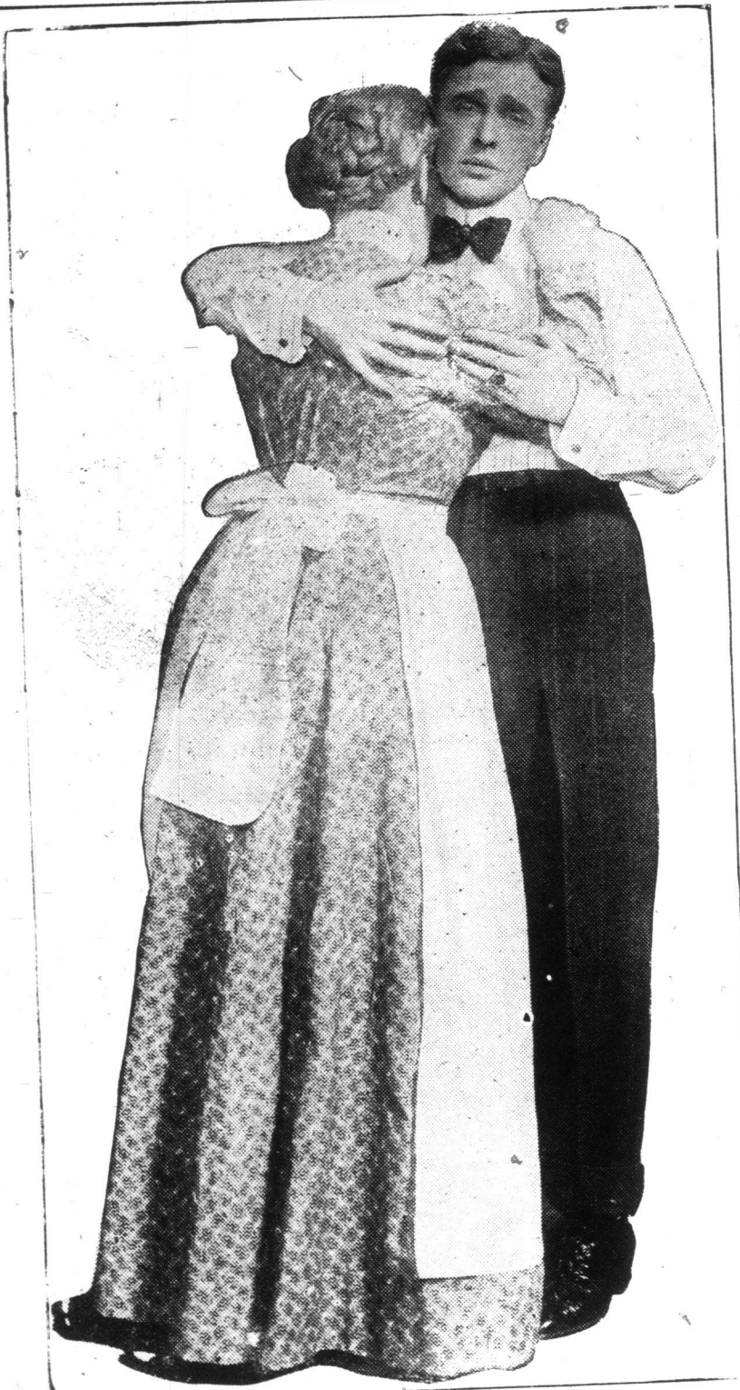
SCENE FROM THE BIG COMEDY SUCCESS "THE COUNTRY BOY," THE OFFERING AT THE GRAND OPERA HOUSE THIS WEEK.

NEXT WEEK - THE GREAT NEW ENGLAND CLASSIC 'WAY DOWN EAST WITH THE FAMOUS FARM SCENE AND BIG PRODUCTION - NEXT WEEK