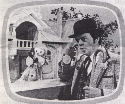
A scene from Bobino, Radio Canada's longest running children's program.