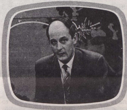
Always interested in public affairs, former journalist René Lévesque was host of Point de Mire from 1956 to 1958.

ledge between two human beings — an obvious, almost tangible transfer; secondly, the capturing on the screen of this most intimate, quasi-mystical transfer, this special rapport which had been established in such a short time between these two musicians, transcending the barriers of language and age, with the main means of communication being the notes of a scherzo and the question of how best to