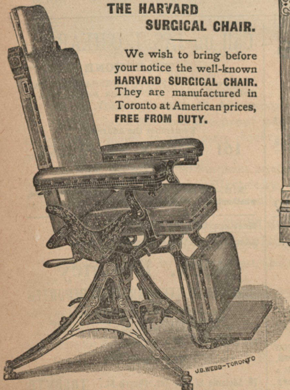
The Harvard in the upright position with head rest folded back.

We wish to bring before your notice the well-known HARVARD SURGICAL CHAIR. They are manufactured in Toronto at American prices, FREE FROM DUTY.