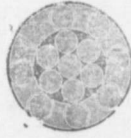
Locked Coil Aerial Cable or Colliery Guide.