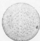
Locked Coil Winding Cable.

Manufacturers of all Kinds of WIRE ROPES for Mines, Tramways, Aerial Ropeways, Suspension Bridges, Cranes, Elevators, Transmission of Power, Steam Ploughing and General Engineering Purposes.