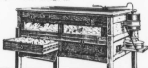
The Peerless Incubator (guaranteed for years) that has helped 15,000 Canadian Poultrymen to greater profits.

Given the same care, time and attention as any other branch of agricultural work, there is no department that can be made to yield such handsome returns on small investment. We know this—15,000 Canadian poultrymen, working with our co-operation, have proven it for us. But it is one thing merely to "keep poultry" and quite another to get every last cent of profit out of the work. The profits are in the knowledge you possess—knowledge of how to proceed, in the first place, and after that, knowledge of how to market your output. The Peerless Way will guide you on both these essential points—will show you what to do and how to do it—and then, through our co-operative marketing plan, will take care of all the eggs and poultry you can produce and at highest market prices. When you get our book, read the letters we have printed in it from hundreds of followers of The Peerless Way in every part of the Dominion—letters from practical poultrymen who have never been able to do by any method what they have done by The Peerless Way. Get the book—just send the coupon—that brings it.