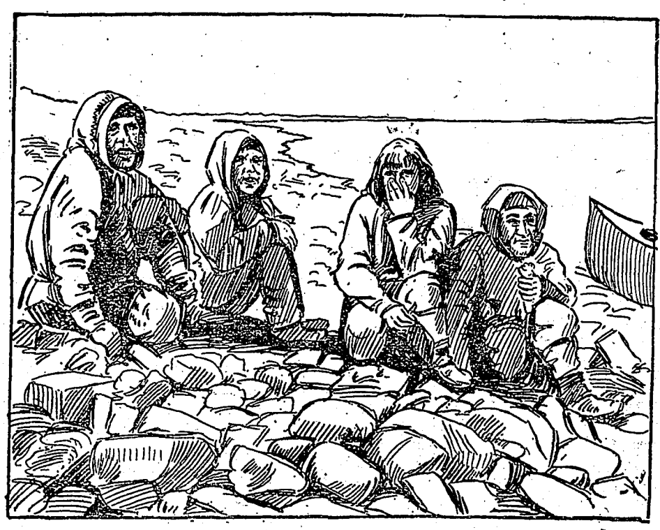
GROUP OF ESKIMO, FORT CHURCHILL:

What a strange village! There are about a dozen tents, not pitched on a soft, smooth place, but right on the stones. How ever do they sleep in such places? Eskimo can sleep anywhere, and a few stones are of no account. And oh, what a dirty, greasy mess, a perfumery of the strongest kind! Never mind; do not think of it, and you will soon get over it. We will enter into one tent. See, there is no fire, nor any chairs, tables, or other furniture, except a few skins spread on the ground. We take our seat on these; men, women, and children crowd around; and One man, the work of teaching begins. stripped to the waist, is mending an old kettle: another is forming the ribs of a kyak (Eskimo boat). A woman is diligently chewing away at some seal-skin (not very sweet!), whilst another is sewing boots.