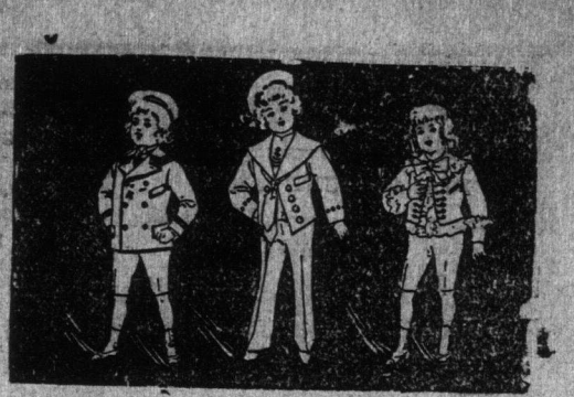
Sale Prices for Cash.