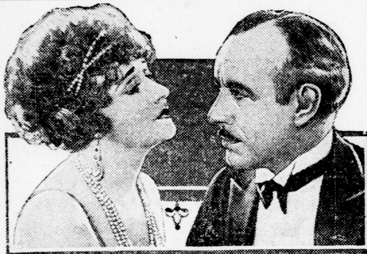
Anna Q. Nilsson and Lewis Stone in "Inez From Hollywood" at Loew's on Monday, Tuesday and Wednesday. It's a picture on the life of movie stars out in Hollywood.