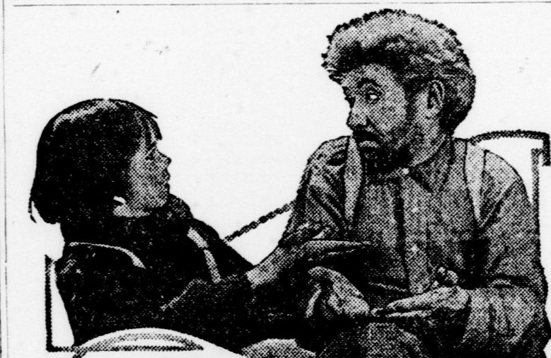
Jackie Coogan, the world's greatest and most lovable juvenile actor, appears at Loew's on Thursday, Friday and Saturday in "The Rag Man," a great comedy on New York's east side.

Aspirin is the trade mark (registered in Canada) of Bayer Manufacture of Monoacetic-acidester of Salicylicacid (Acetyl Salicylic Acid, "A. S. A."). While it is well known that Aspirin means Bayer manufacture, to assist the public against imitations, the Tablets of Bayer Company will be stamped with their general trade mark, the "Bayer Cross."