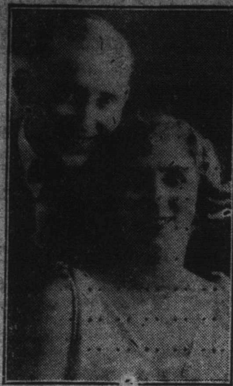
Now Playing at the Majestic