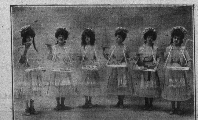
Scene From Sergeant Kitty

It neither sounds well nor does it appear well to call others ugly names.