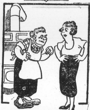
M. L. MEHLBINE

The initial outlay and the cost of the upkeep of these midge aeroplanes have received every consideration. The average purchase price ranges from $900 to $1,250, and a fair example of performance is given by the "Avro Baby." It is equipped with a 35 h.p. Green engine, and is capable of a speed of 75 miles an hour and will give 25 miles on a gallon.