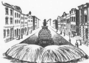
Studebaker Sprinkler (PATENT IMPROVED.)

Because no sweeper so effectively does the work for which it is designed as "The Studebaker." It sweeps Clean. No sweeper is constructed with the same degree of care and mechanical precision. It Wears Well. "The Studebaker" has the smallest number of working parts, and has less gearing than any other sweeper made. It is free from all unnecessary complications. With reasonable care it does not get out of order. Send for complete descriptive catalogue.