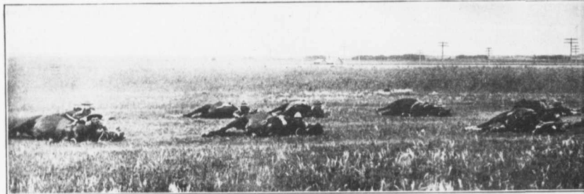
USING THEIR HORSES FOR COVER.—A MOUNTED CADET TROOP ON CHEWAN LIGHT HORSE.

canvas, representing all nations, grew up on the deep snow drifts at the summit.