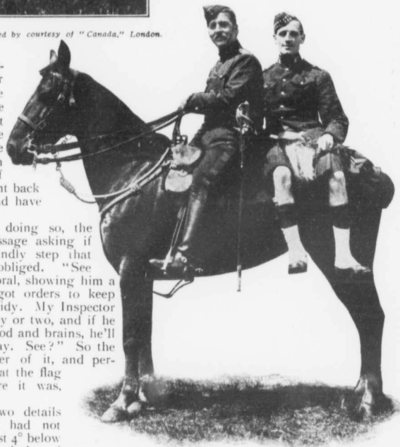
A LIFT ON THE MARCH.

With the South African War came a new phase in the history of the Canadian Forces. Once before, during the Nile Campaigns, Canada had been permitted to supply a force of six hundred river men for transport work, and the record of her voyageurs was