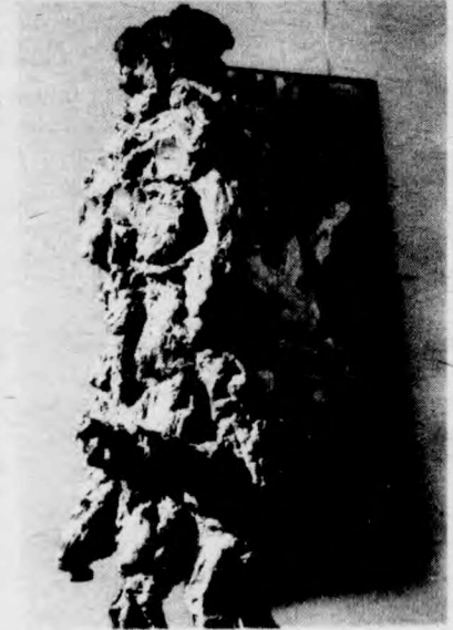
One of De Kooning's works on display at the Pollack gallery.

But if you're into up-tempo Chicago blues and have $3 to spend on the weekend you shouldn't have any trouble finding a good time. Howlin' Wolf sits on the stage between sets and you'll have every opportunity to meet him — he's very friendly and a fine musician even if he won't play guitar anymore.