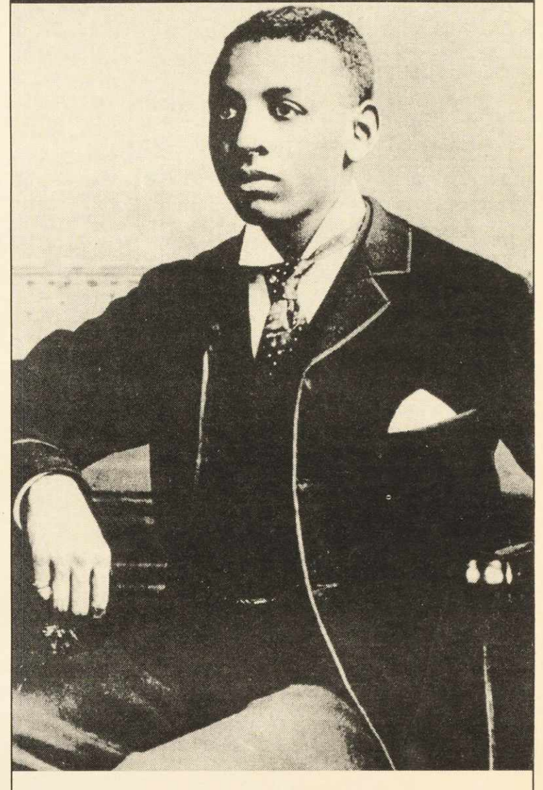
Do you know this man? Why are Canadian academics so concerned about his chair?