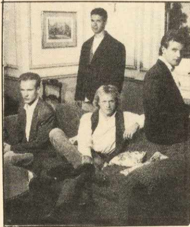
Level 42: New Music for Tupperware Parties

After the mega-success of his last album Into the Light , you might figure that Chris was on a roll. After all, he has been more or less improving at a constant rate since his first LP Spanish Train . With the release of Flying Colours Chris has set a new