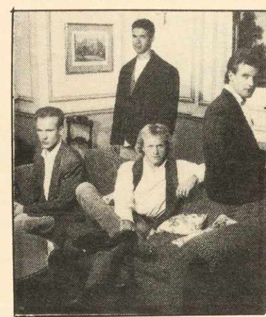
Level 42: New Music for Tupperware Parties

After the mega-success of his last album Into the Light, you might figure that Chris was on a roll. After all, he has been more or less improving at a constant rate since his first LP Spanish Train. With the release of Flying Colours Chris has set a new