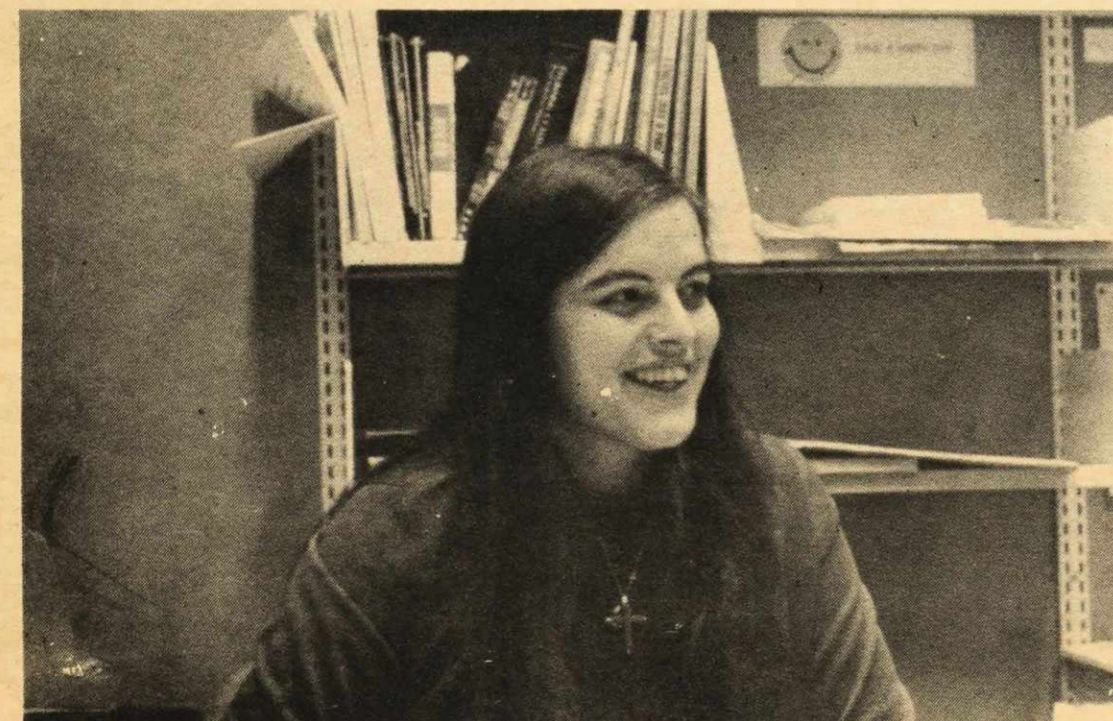
Pittas... division was necessary.