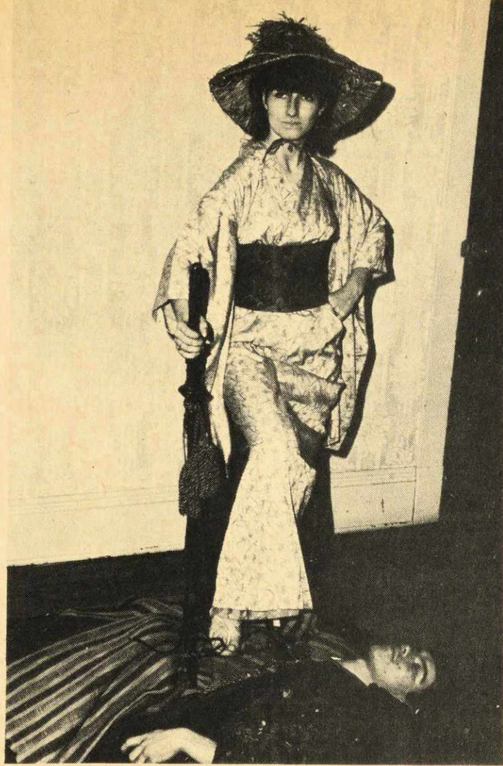
Mikado Feb. 17-20