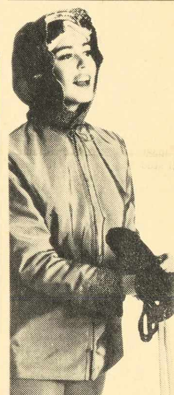
A FEW COGENT REASONS FOR USING TAMPAX IN COLD WEATHER