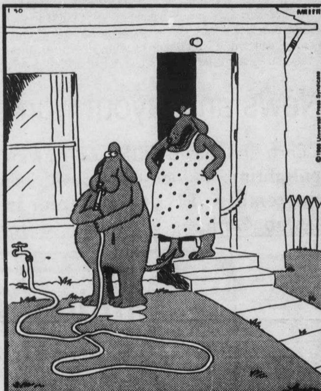
"So! Planning on rotaming the neighborhood with some of your buddies today?"

FALLING Gold leaves Fall on passers-by Like blessings Downtown At this time of year And you can't walk Except for trampling on them Counting as you go