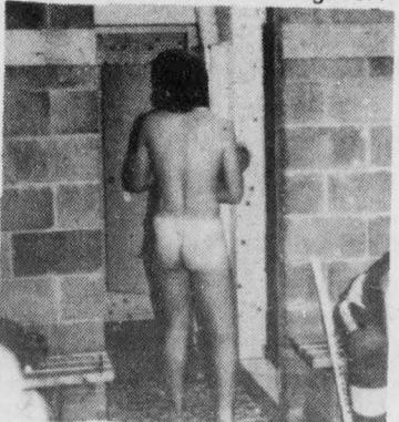
One of the players shows off his best assets