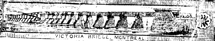
VICTORIA BRIDGE, MONTREAL. MONTREAL:

Published by C.R. CHISHOLM & BROS., Railway General News Agents.