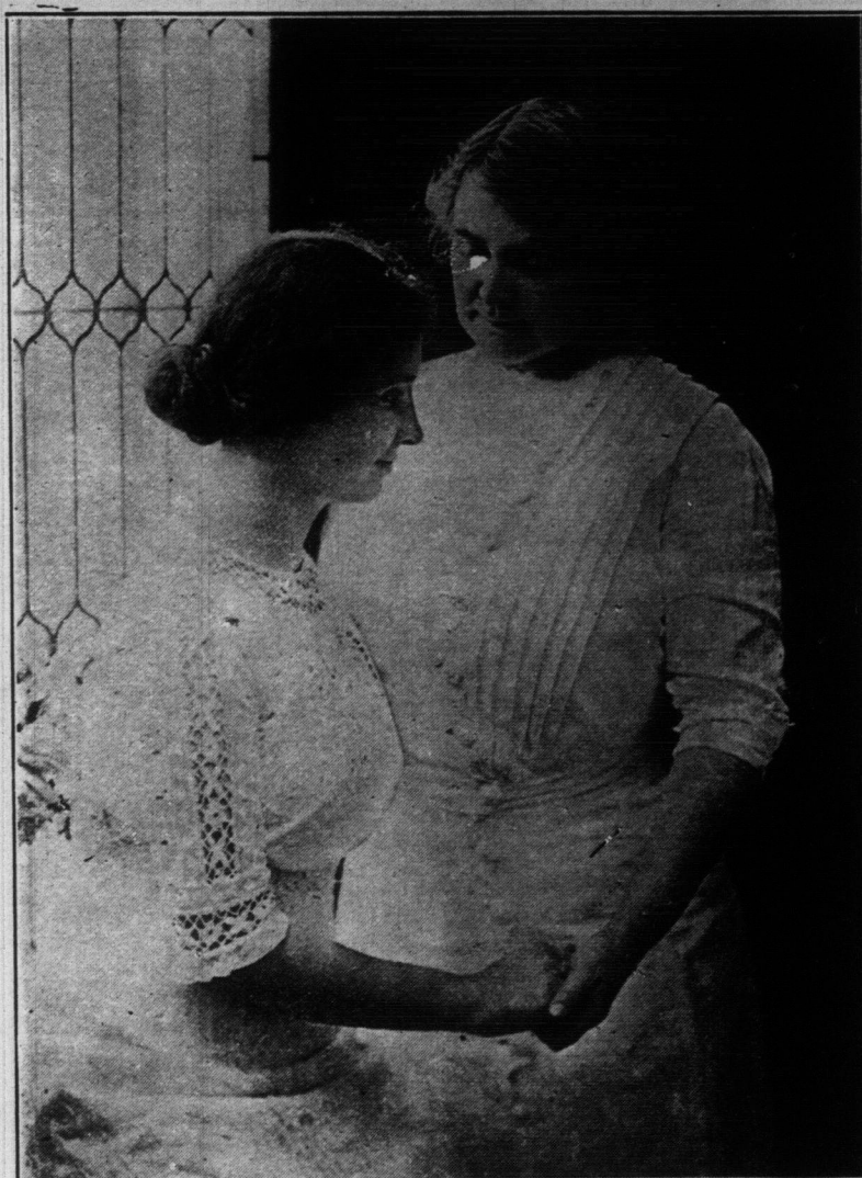
HELEN KELLER. Edwin Markham, the poet, said: "Helen Keller is the most interesting being on the planet." Although both deaf and dumb, she graduated from Harvard University, and is the author of several books. She began to speak twenty years ago, and has recently taken a course in voice culture, from the professor of music in Harvard University. She has become a public lecturer and has met with great success. She will lecture in Toronto in January.