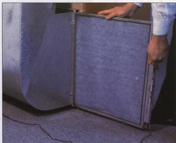
The ceiling-mount and floor models of the Dynamic Electronic Air Filter are available with 2.5 cm (1 in.) and 5 cm (2 in.) panel thicknesses.

Dynamic installations include residential housing, complete office buildings, factories, lunchrooms, bars and smoking rooms in North American, Far Eastern and European markets.