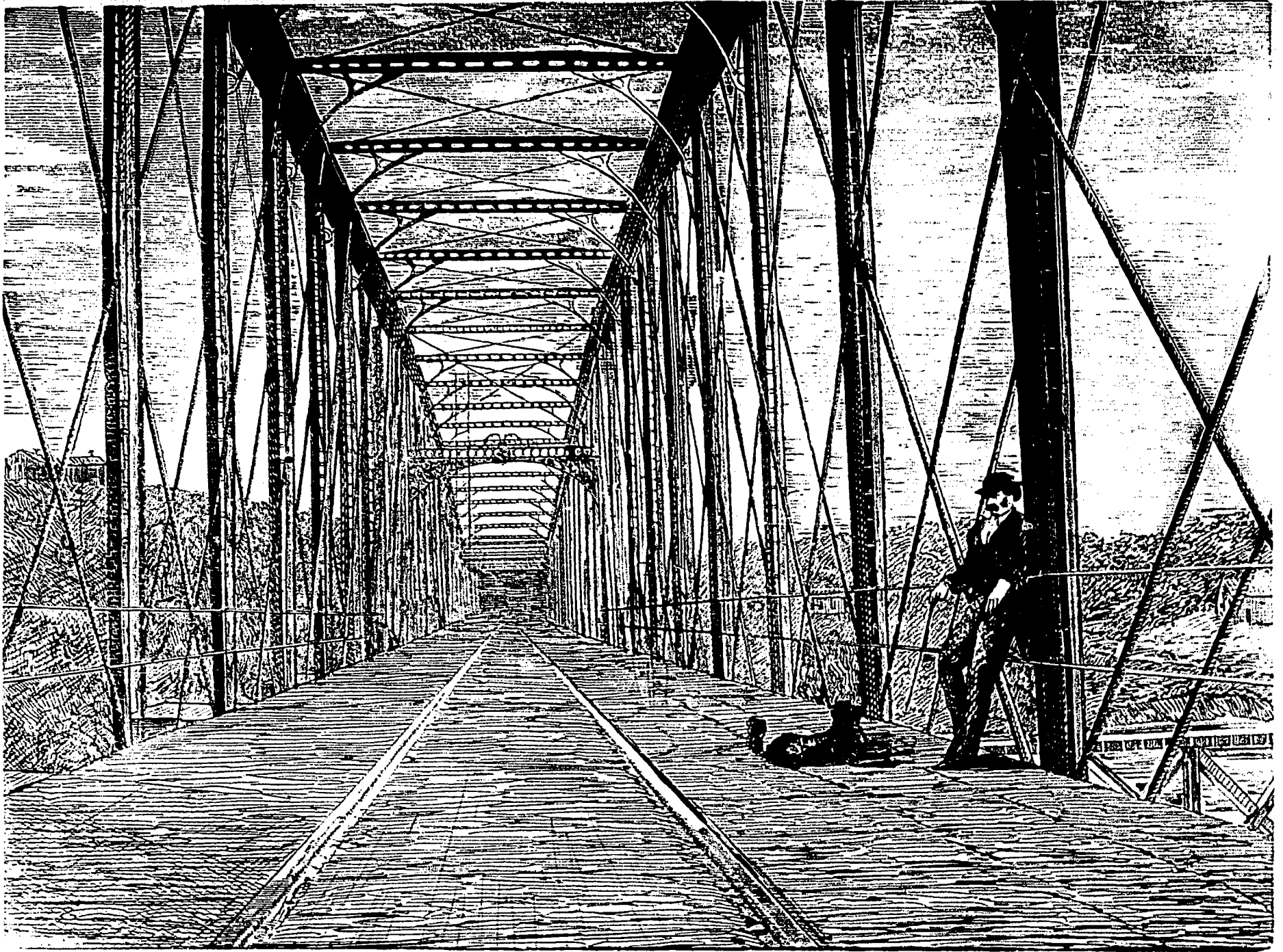
BRIDGE ACROSS THE MISSOURI. AT KANSAS CITY, U. S.—PERSPECTIVE VIEW. From a photograph.—SEE PAGE 28.