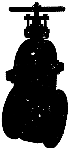
Flanged End Gate Valve with Hand Wheel.