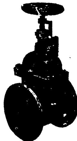
Indicator Gate Valve.

Railway Supplies, Structural and Ornamental Iron Work