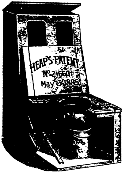
Inodorous Portable Bedroom Commode

- A Special Silver Medal Awarded at Toronto, 1885 -