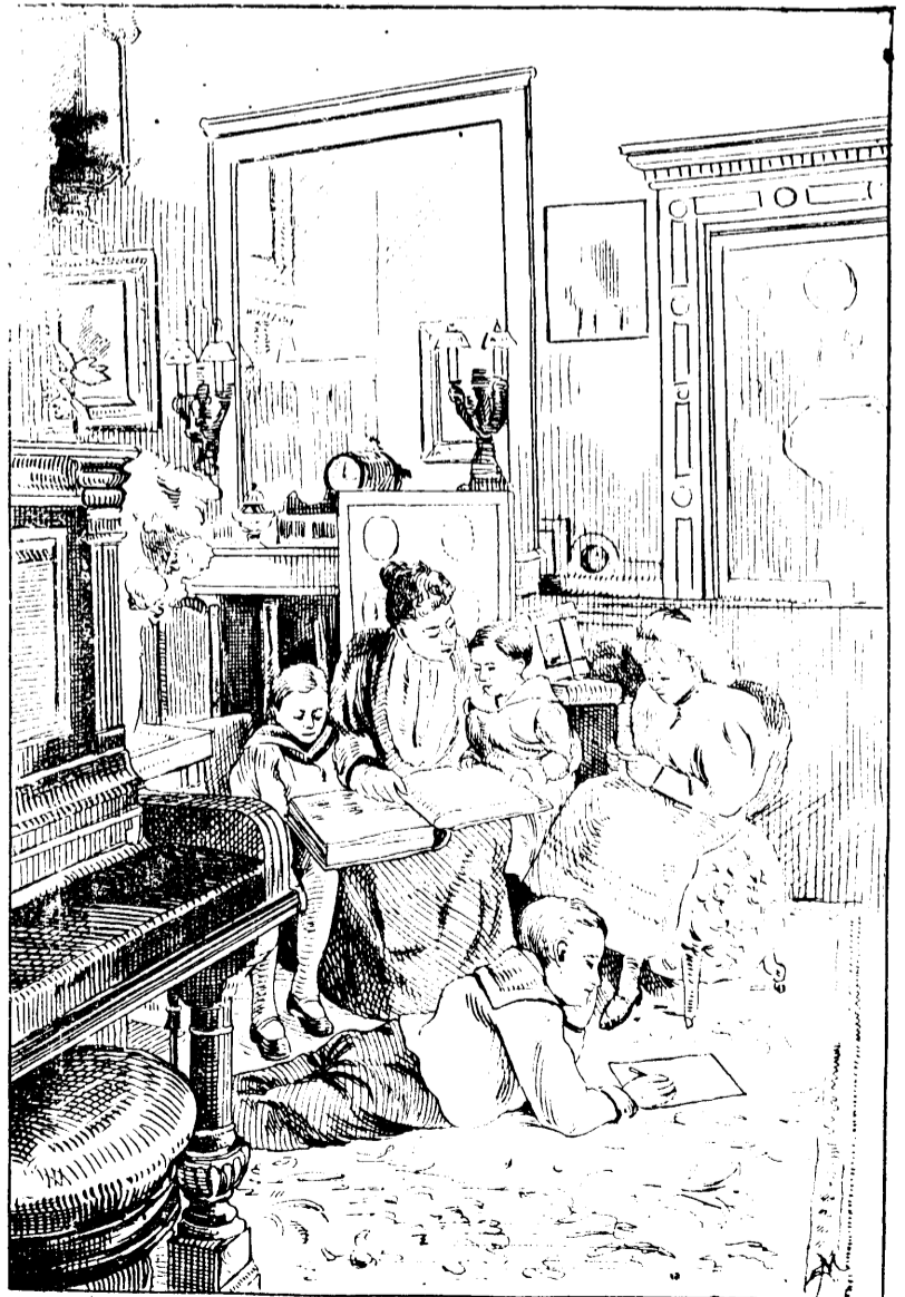
PRINCESS HENRY OF BATTENBERG AND HER CHILDREN.

'I am quite clear she should have great reverence for God and religion, but that she should have the feeling of devotion and love which our heavenly Father encourages His earthly children to have for Him, and not one of fear and trembling; and that the thoughts of death and an after life should not be represented in an alarming and forbidding view; and that she should be made to know as yet no difference of creeds, and not