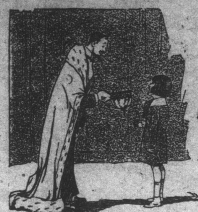
LONDON--THE KING TAKES OFF HIS HAT TO JACKIE

HE'LL STEAL YOUR HEART AWAY. The Kid himself in a role like that he had in "THE KID."