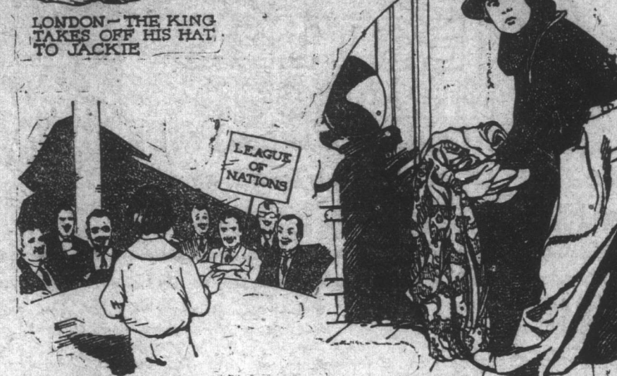
GENEVA--THE LEAGUE OF NATIONS STOPS WORK TO GREET HIM