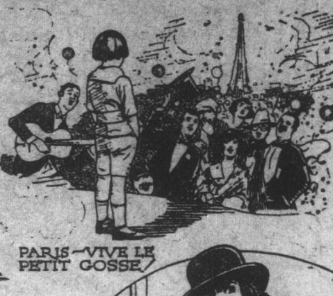
PARIS--VIVE LE PETIT GOSSE