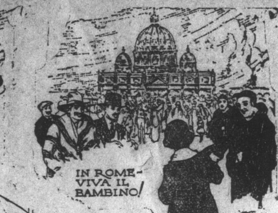
IN ROME--VIVA IL RABBITINO