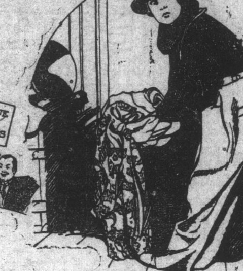
BACK HOME IN "THE RAG MAN" THE NEW METRO GOLDWYN PICTURE