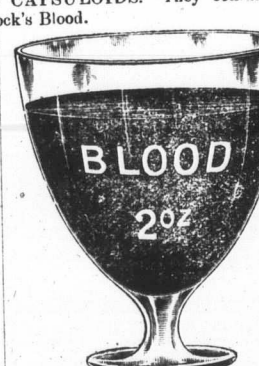
This represents the exact amount of Rich Red Blood added to your Blood. Vessels by taking one Capsuloid each meal three times daily.