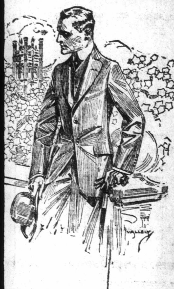
Society Brand Clothes

Copyright 1912. Adm. Cl. Reg. U.S. Pat. &amp; Tm. Off.