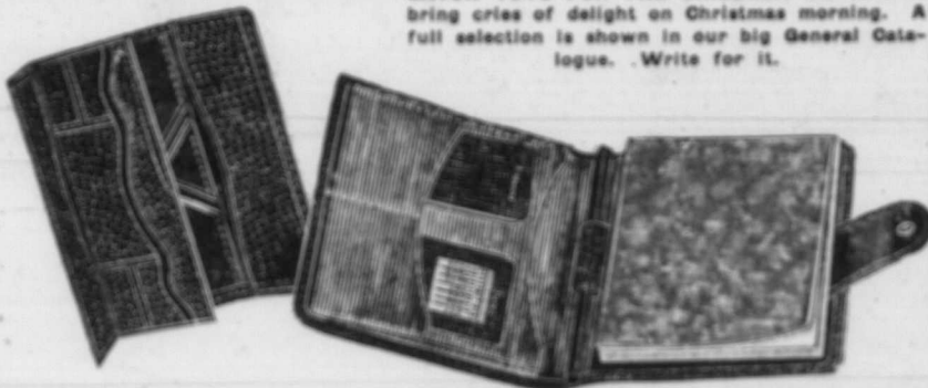
32591. Men's Real Leather Wallet. Seal grain, automatic centre, fine quality. Price ..... 1.00

EATON TOYS FOR THE CHILDREN are sure to bring cries of delight on Christmas morning. A full selection is shown in our big General Catalogue. Write for it.