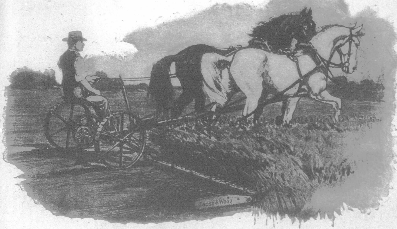
4, 5 AND 6 FOOT CUT.

"O YES!" Our No. 8 Mower will start in heavy grass without backing the team, and will cut grass any other mower can out. Will run as easy and last as long. We sell our machines on their merits, and build our reputation on the "quality," not the quantity, of goods we make.