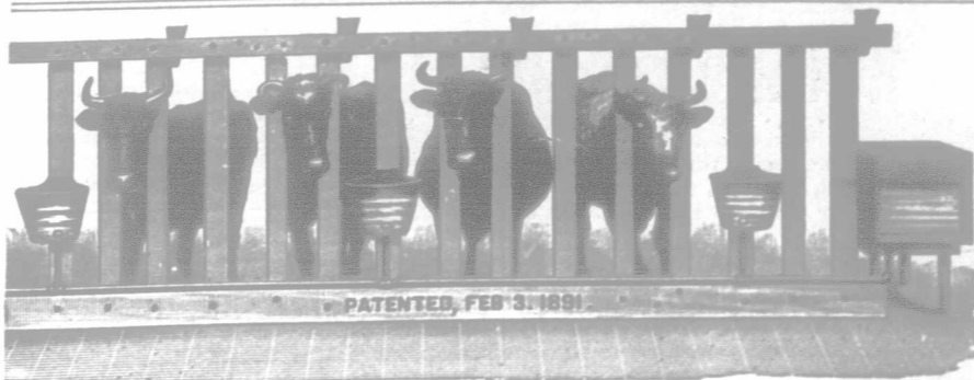
RANEY, SELBY & COMPANY, BOX 620, KINGSTON, ONTARIO.