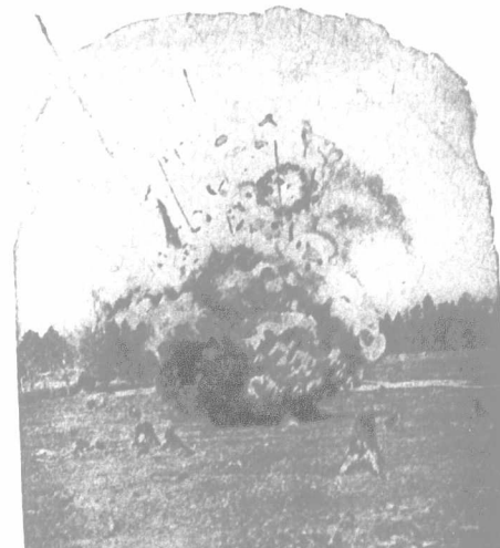
What happened to the stump by using Stumping Powder.