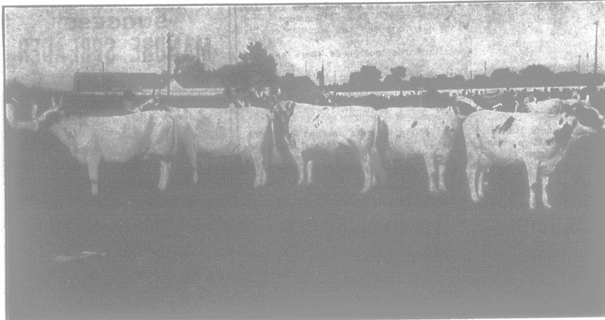
First-prize Herd of Ayrshires at Toronto and London Exhibitions, 1905.