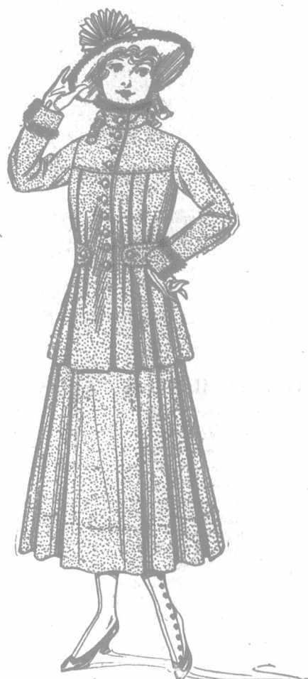
8833 (With Basting Line and Added Seam Allowance) Coat with Plaits for Misses and Small Women, 16 and 18 years.