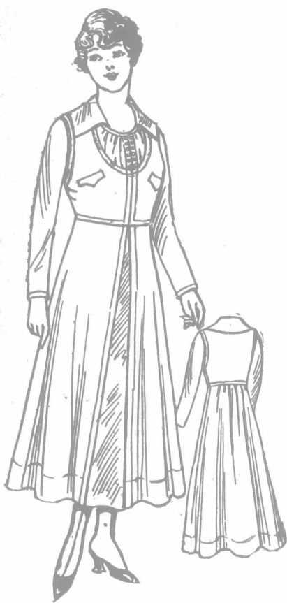
8802 (With Basting Line and Added Seam Allowance) Gown with Over-Bodice, 34 to 42 bust.