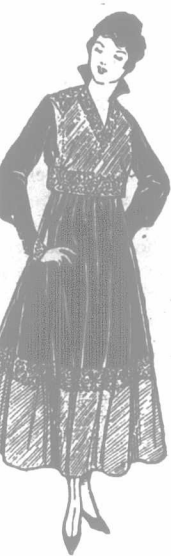
One-Piece Gown, 34 to 42 bust.