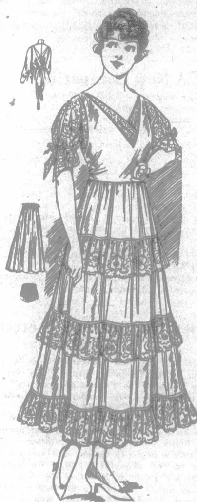
8799 (With Basting Line and Added Seam Allowance) Fancy Waist, 34 to 42 bust.