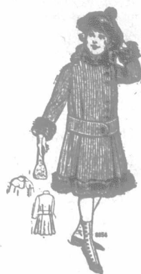
8854 Girl's Coat in Russian Style, 8 to 14 years.