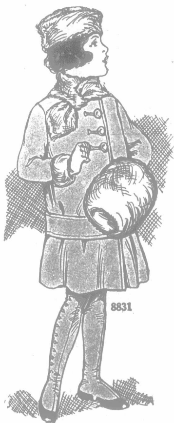
8831 (With Basting Line and Added Seam Allowance) Child's Fur Set consisting of Neck Piece, Muff and Cap, 2 sizes 2 or 4, 6 or 8.