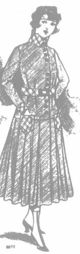
One-Piece Dress, Misses and Small Women, 16 and 18 years.