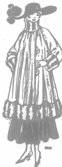
8844 Gathered Coat, Small 34 or 36, Medium 38 or 40, Large 42 or 44 bust.