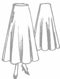
8851 Two-Piece Skirt, 24 to 34 waist.