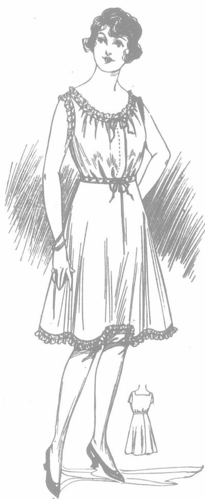
8827 (With Basting Line and Added Seam Allowance) Combination Corset Cover and Envelope Drawers, 31 to 42 bust.