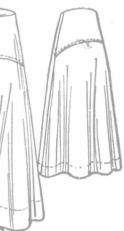
Basting Line and Added Seam Allowance) Skirt with Yoke, 34 to 32 waist.