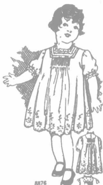
8876 Child's Dress, 1, 2, 4 and 6 years.