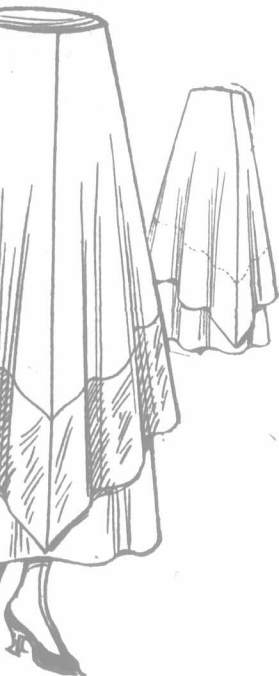
Basting Line and Added Seam Allowance) Two-Piece Skirt, 34 to 32 waist.