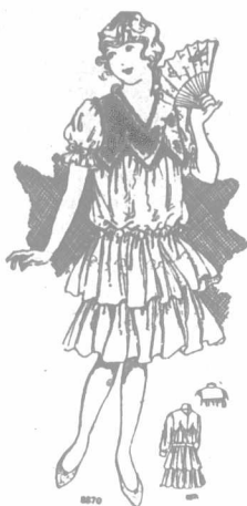
8870 Girl's Dress, 8 to 14 years.