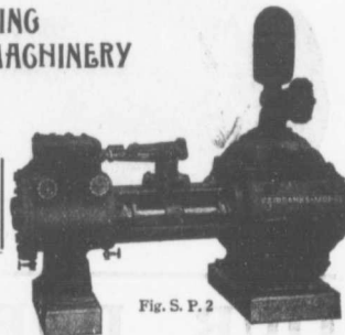
Fig. S. P. 2

The Canadian Fairbanks Co., Limited MONTREAL TORONTO WINNIPEG VANCOUVER