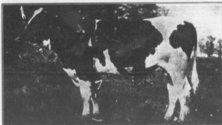
13 - A Deep Well Developed Individual of Good Breeding Springbank Butter Boy, 14 months; dam is Queen's Butter Girl. Sweepstakes cow at Ottawa Dairy Test and record of over 24 lbs butter in 7 days. Sired by Wopke Paama. Heading H. G. Bonfield's herd, Woodstock, Ont., who is consigning to the June 12 sale four females in calf to this bull.