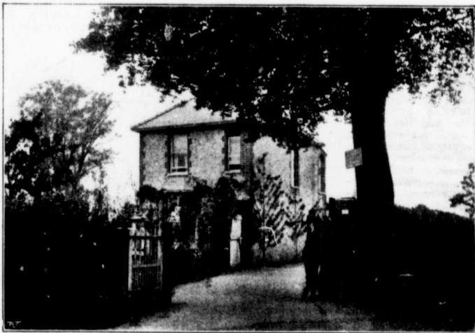
VIEW OF FOUNDER'S HOUSE, WITH OUTSIDE SEAT FOR WAYFARERS.

THERE are two weighty questions much debated at present, in every family where there are young people of both or either sex growing up, and needing some provision to be made for their future living and maintenance. If the family fortune be not enough to supply more than a certain amount of education, or a few hundreds of pounds for an outfit and settlement, the questions of "Where shall we send him? What shall we do with her?" become even more puzzling still. Formerly it was only the boys who had to be thought of, now the girls also claim their share of education; which, if not professional, must be one of an advanced and excellent kind, or they cannot expect to compete with their fellows in life. Every girl does not want to be a doctor, and the profession of a nurse is much overstocked; the Civil Service will not provide for every one; and though music and the arts take some, perhaps, off our hands, we are still confronted with the question, for boys as well as girls: How can they make a living in the world of to-day? What a relief from these anxieties it would be were it once demonstrated without a doubt, that an opening